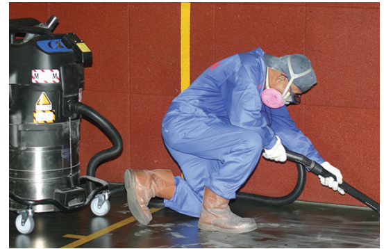
De-leading and dust removal