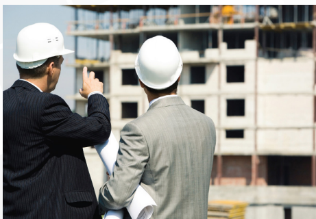
Top right, Our in-house designers can quickly manage design revisions