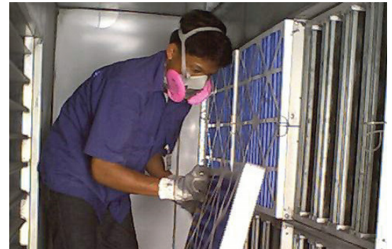
Replacing HEPA filters