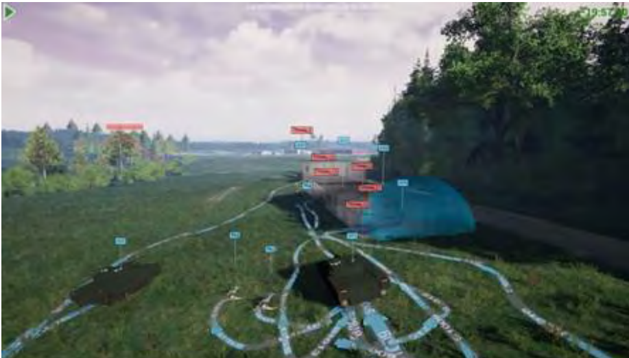
CATS Metrix 3D view with tactical graphics.