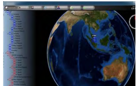
CATS Player is used for Take Home Package playback.

Connects with external systems using standard interfaces.