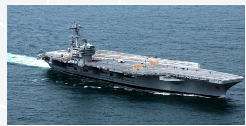
CVN-class vessels are equipped with Cubic-built dual CDL ground data terminals.