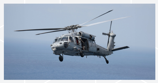
The U.S. Navy MH-60S carries Cubic's TCDL data link.