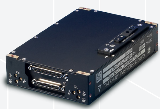
Cubic's Multiband Miniature Transceivers are the communications engines of the DCM. Interoperability with all Specification-compliant devices is assured, including Video Scout and ROVER.