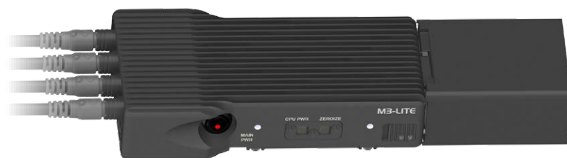
Complete Hook-up with Battery Unit and Cables