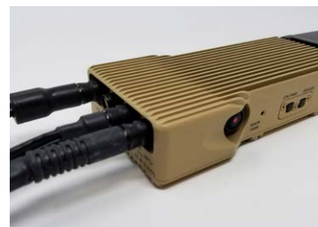
Cable Attachments Ports