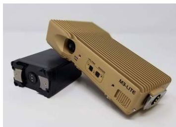
M3-Lite Detached from Battery

Built with lightweight materials, IP68 environmental protection, and compatibility with the popular AN/PRC-148 handheld battery, the M3-Lite is ready to serve wherever you do.