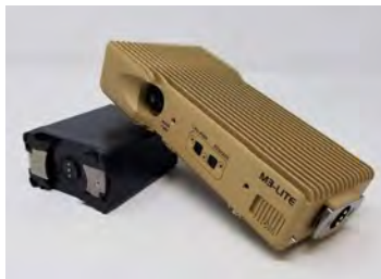
M3-Lite Detached from Battery

Built with lightweight materials, IP68 environmental protection, and compatibility with the popular AN/PRC-148 handheld battery, the M3-Lite is ready to serve wherever you do.