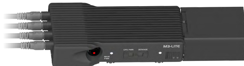
Complete Hook-up with Battery Unit and Cables

THE APPEARANCE OF U.S. DEPARTMENT OF DEFENSE (DOD) VISUAL INFORMATION DOES NOT IMPLY OR CONSTITUTE DOD ENDORSEMENT.