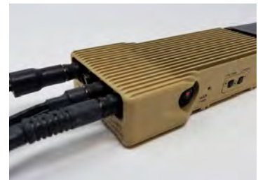
Cable Attachments Ports