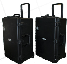
GATR 2.4m (2 cases, < 200 lbs total)