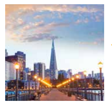
C METROPOLITAN TRANSPORTATION COMMISSION SAN FRANCISCO BAY AREA THIS SYSTEM SUPPORTED 20 REGIONAL TRANSIT OPERATORS AND 254 MILLION RIDES LAST YEAR ALONE

TRANSLINK BRISBANE, AUSTRALIA LAST YEAR $378 MILLION IN REVENUE WAS PROCESSED AND APPORTIONED AMONG 17 PARTICIPATING REGIONAL OPERATORS